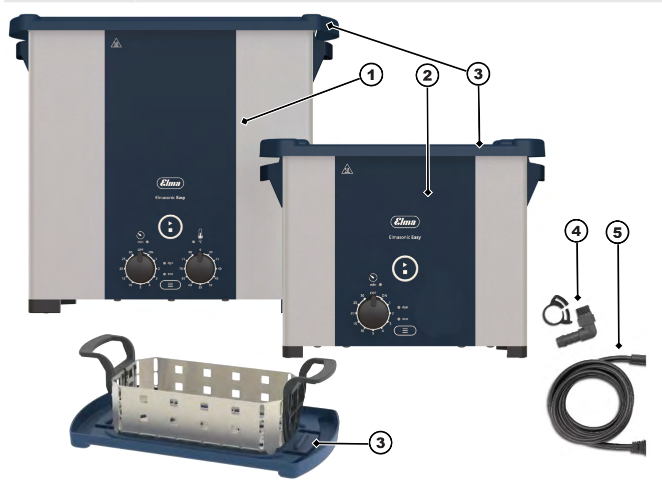
Illustration 1: Product contents