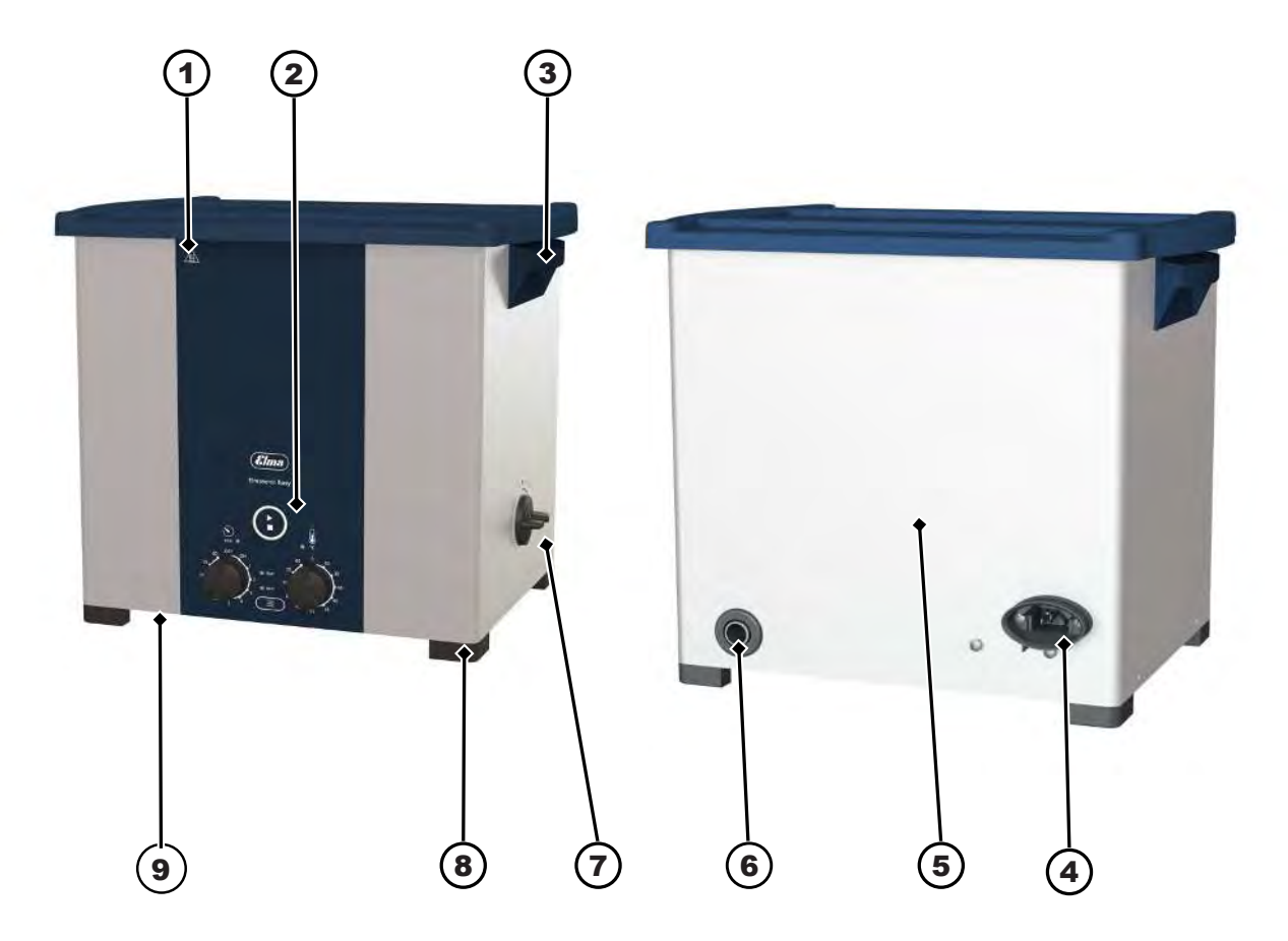
Illustration 2: Operating side/rear side